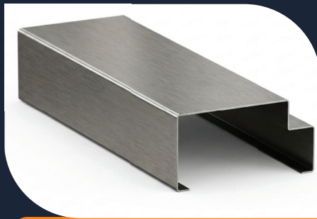
VIEW 2 : 5 INCHES RIGHT RIVET FRAME